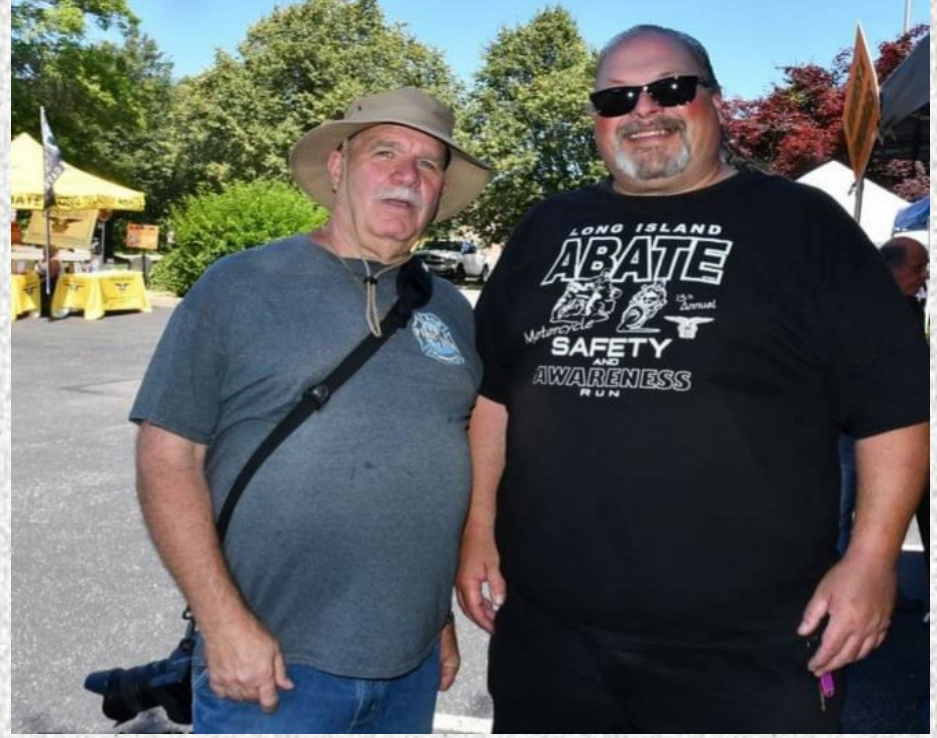
Long Island ABATE Does Not Endorse Any Advertiser or Product In This Publication