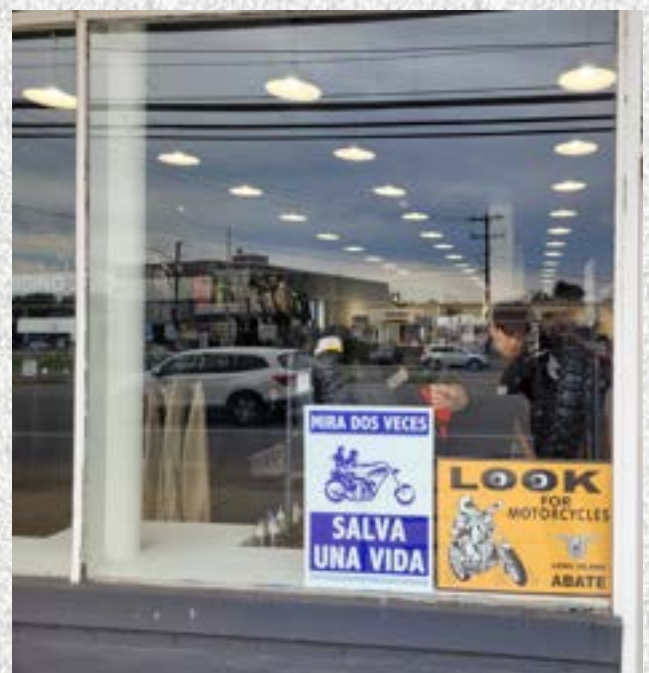
Long Island ABATE Does Not