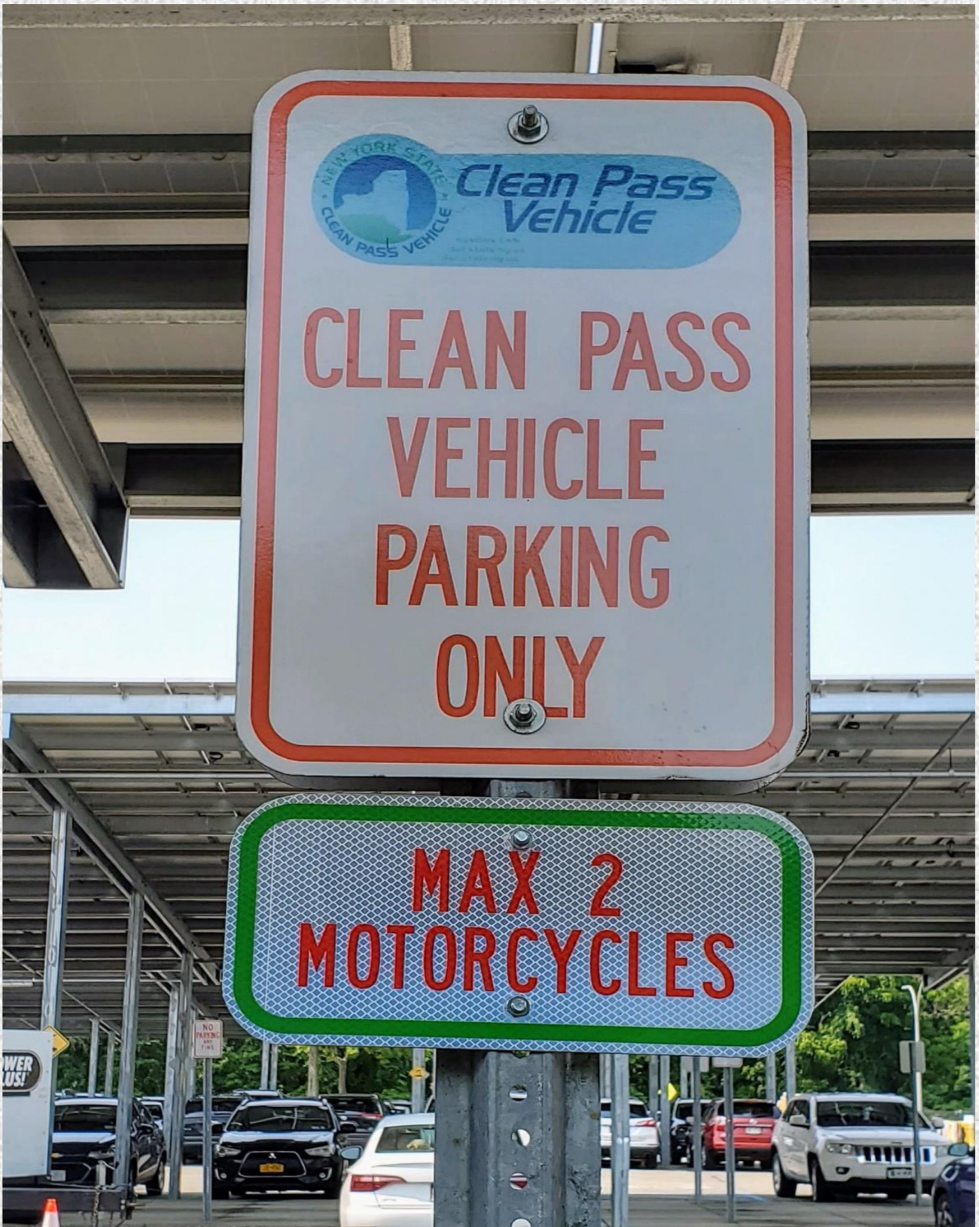
TAKEN AT THE H. LEE DENNISON BUILDING, HAUPPAUGE